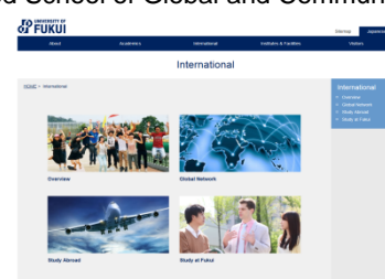
(New website: International)

Administrative staff were dispatched internationally for benchmarking research and negotiation to conclude academic exchange agreements with overseas universities for widening awareness about developing a university office environment for globalization.